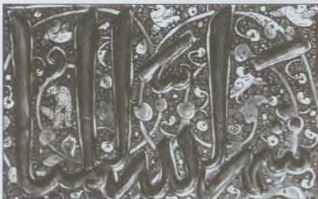
Detail of a wall tile. Near East Collection, Seattle Art Museum